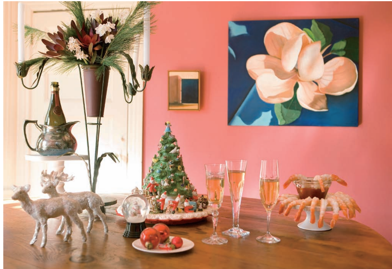
Tea lights and paperwhites, OPPOSITE, welcome holiday visitors. Gretchen's art graces a dining area, BELOW. The smaller painting is a scene of Morocco; the larger one is California Magnolia III .