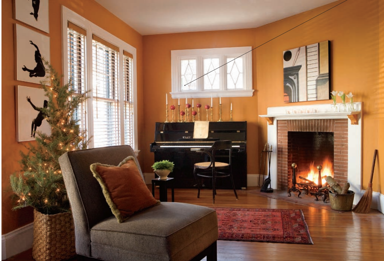
Gretchen's painting Italy XII hangs above the mantel in her living room.

An interesting window configuration in the living room is one of Gretchen Dow Simpson's pleasures. In this triple-fixed transom-type window, the elongated diamond pane is unusual, in that it appears to be floating among the adjoining panes. Small, high, multipaned windows are characteristic of Dutch Colonial style. This architectural form, which harks back to the early Dutch homes of the northeastern United States, was popular from the late 1800s to about 1935. This window reflects a simple elegance, considered an antidote to the embellishments of the Victorian era.